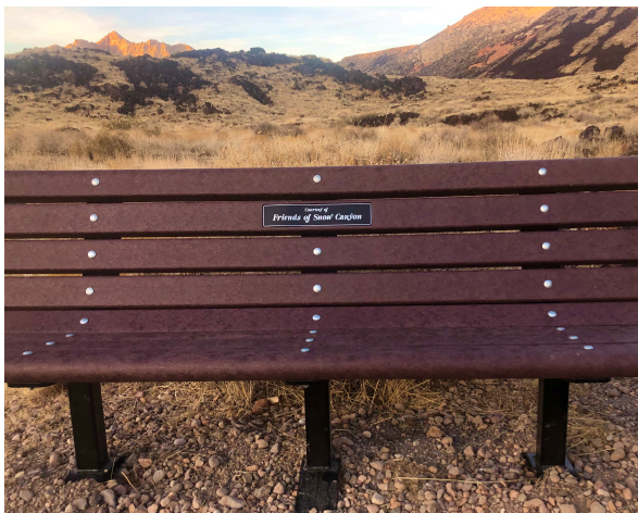
NEWLY INSTALLED BENCH AT UPPER GALOOT PARKING LOT