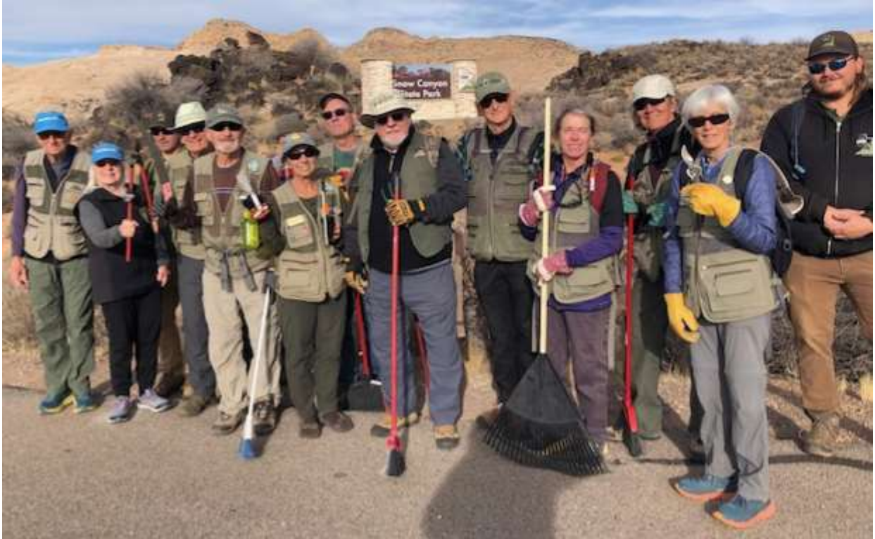
Trail Stewards prepared to erase illegal trails